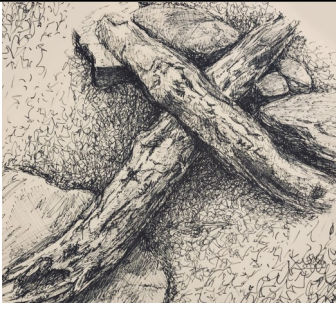
Jesus falls the second time.