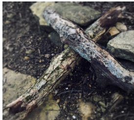
Jesus falls the first time.