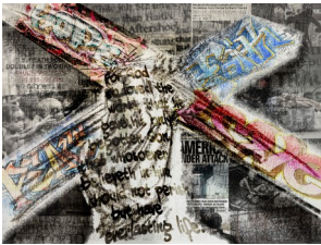
Jesus carries his cross.