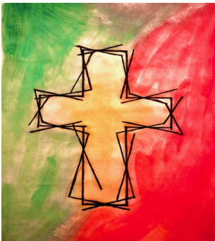
Simon of Cyrene helps Jesus carry his cross.