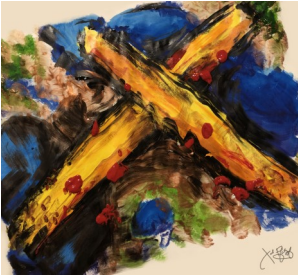
Jesus falls a third time.