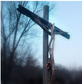
Jesus dies on the cross.