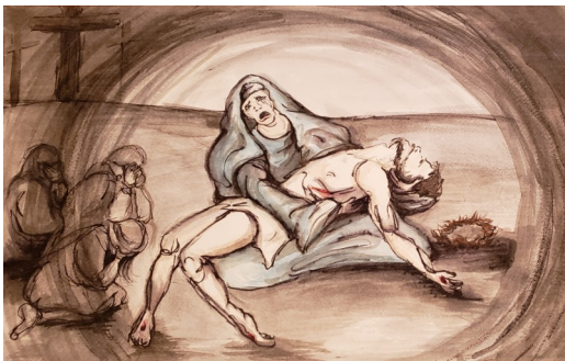
The body of Jesus is taken down from the cross.