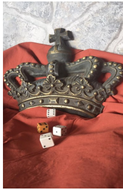
Jesus' clothes are taken away.