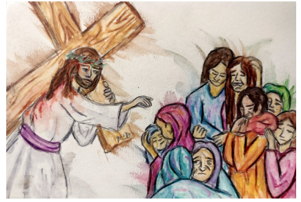
Jesus meets the women of Jerusalem.