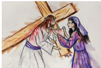
Veronica wipes the face of Jesus.