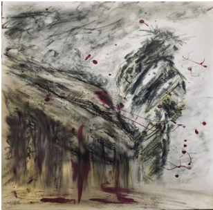
Jesus is condemned to death

For the virtual option, simply visit our Facebook or Instagram page daily to see artwork created by our members depicting each station and read the bible passage and short devotion. You may also opt to physically walk through the stations by spending a few quiet minutes in our sanctuary. Pick up a booklet from the basket at the front of the left side aisle, and walk along the side aisles, stopping at each relief panel depicting the stations along the way to read the corresponding devotion and prayer. May the Holy Spirit guide you during this time of meditation, drawing you in to contemplate what each step in his final walk means to you and your spiritual journey.