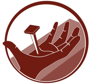
Jesus is nailed to the cross.