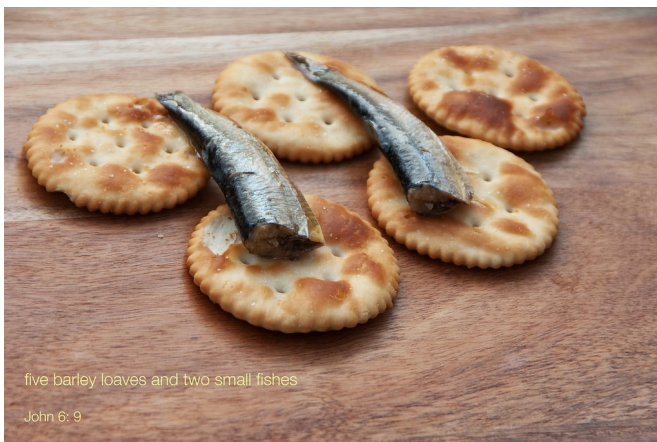
five barley loaves and two small fishes